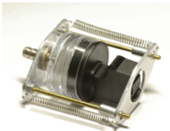
▲ Virtual cyclone sampler